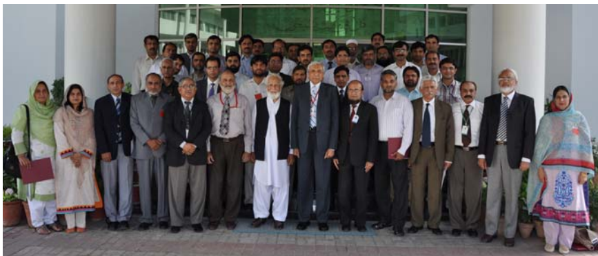
Participants of 1st One Week 4Q Training Course with Chairman PAEC